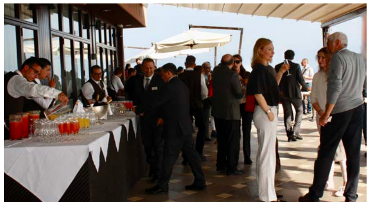
Patient program outside on the Balcony of the Taormina Conference Center, May 6, 2017

Several excellent poster presentations were also recognized this year: