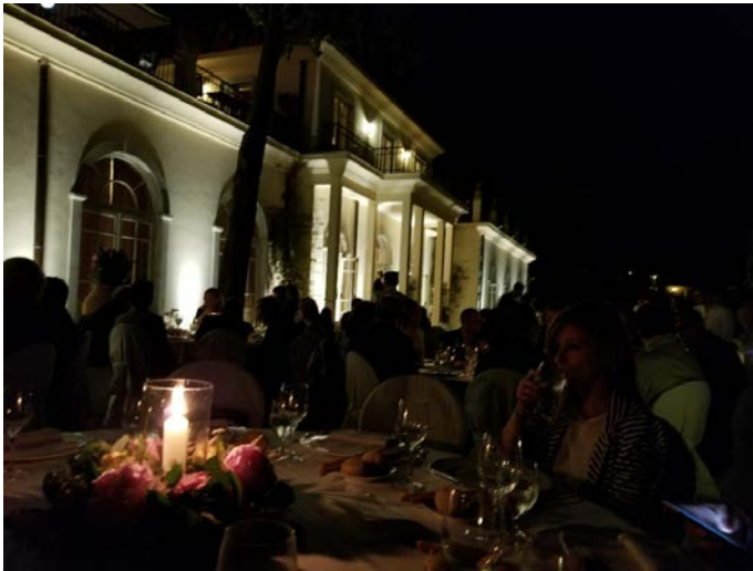
Dinner program on May 5 at the 'Grand Hotel Timeo'