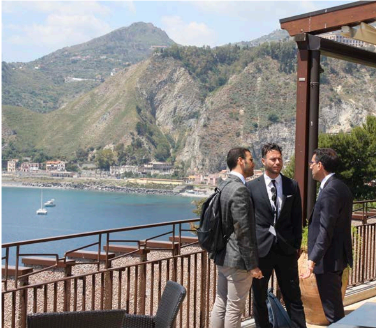
Planning presentation strategies on Day 1 - The coast of Taormina seen from the Atahotel balconv.

This past May 4–6, 2017, the 7th meeting of the International Society for Neurovascular Disease (ISNVD, www.isnvd.org ) was held at the Hotel Capo Taormina (in Taormina, Sicily.)