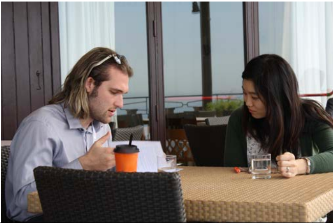
Undergraduate and graduate Students working on presentations.

The next session (Session 6) was the following morning (on May 6 th ) which was entitled “ Late Research and Talks selection from abstracts ”. This session was